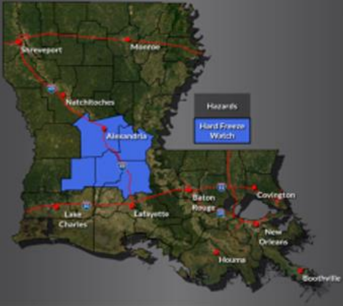
Hard Freeze Warning