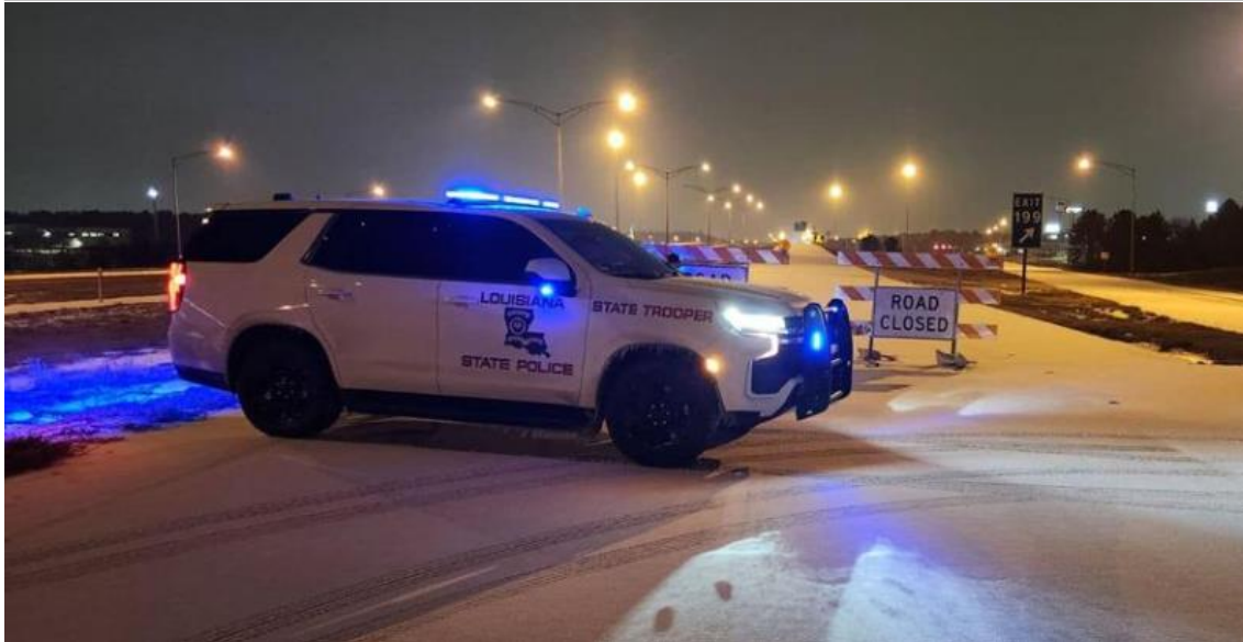
State Police monitoring roadways during winter weather event, KTBS, Jan 16, 2024