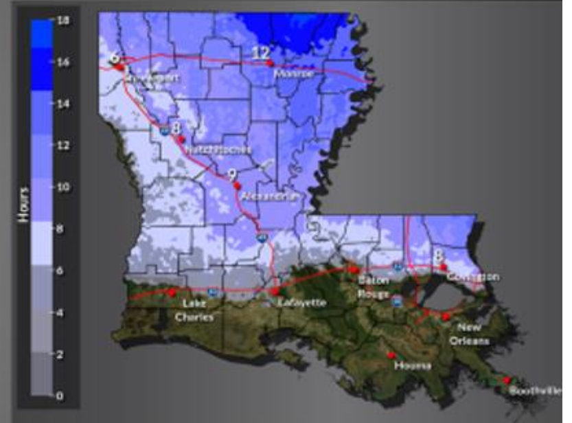
Hours \leq 32F Tonight