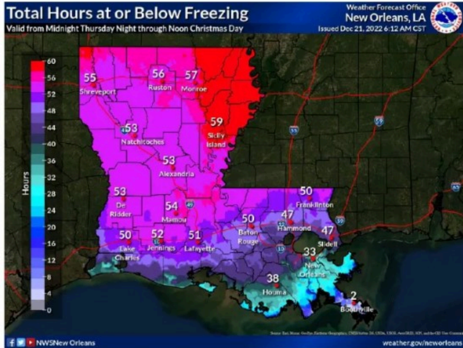
Forecasted total number of hours with temperatures at or below freezing for the event, midnight Thursday night through noon on Christmas Day.

The National Weather Service (NWS) New Orleans has produced updated weather graphics concerning the significant cold weather threat at the end of the week. As always, please reference your local Emergency Management office for advice concerning your area.