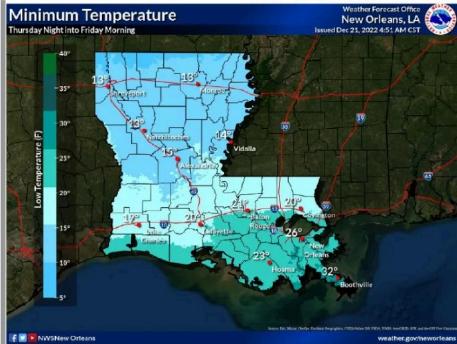
Forecasted minimum temperatures for Thursday night into Friday morning.

Data source: 4am Forecast Package, NWS NO/BR