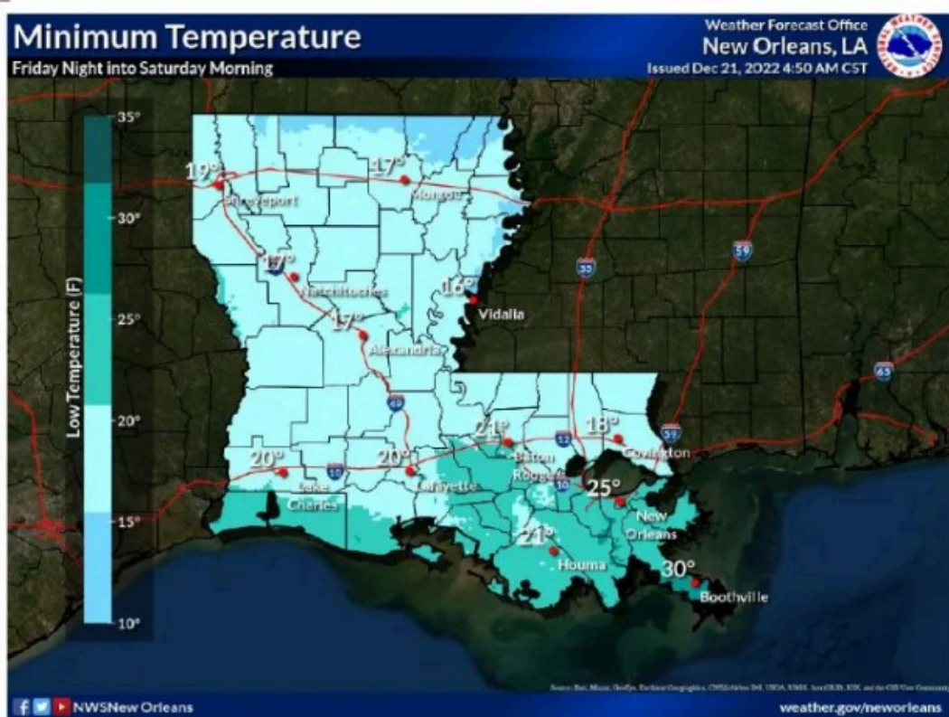
Forecasted minimum temperatures for Friday night into Saturday morning.