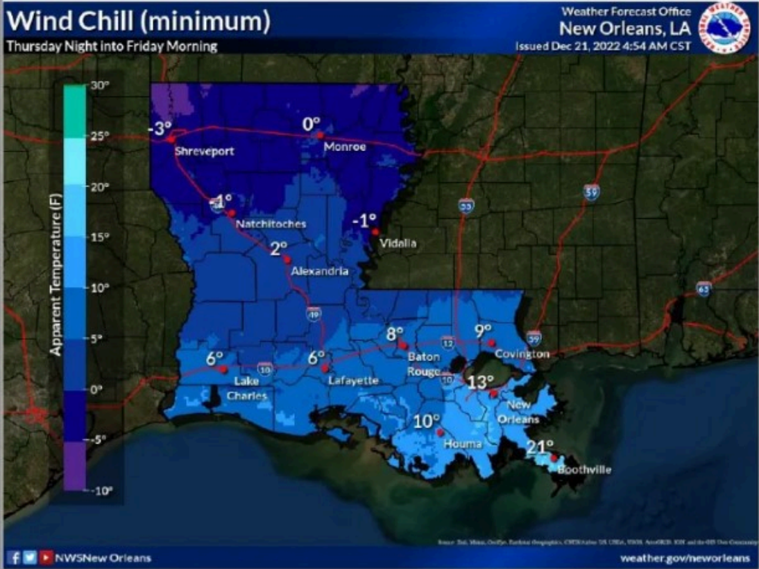
Forecasted minimum wind chills for Thursday night into Friday morning.