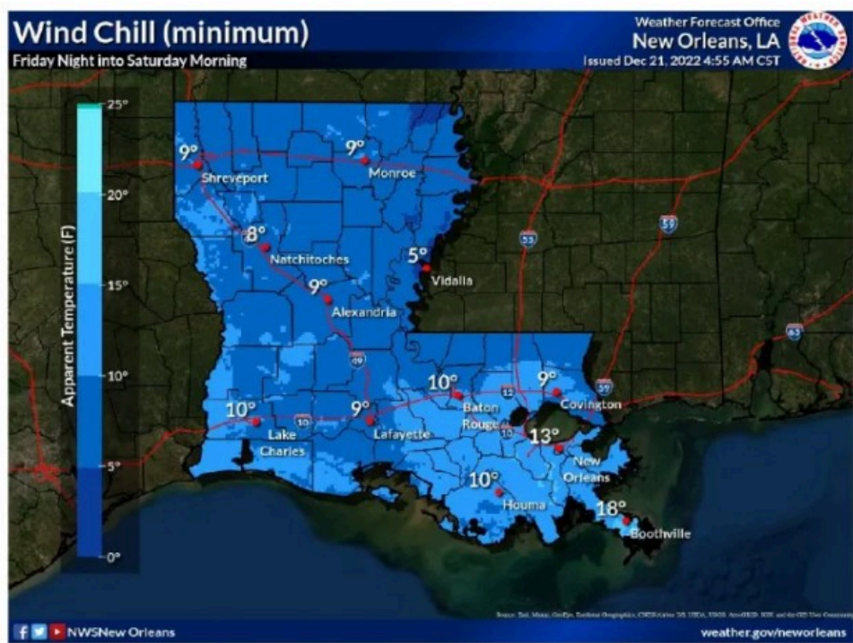
Forecasted minimum wind chills for Friday night into Saturday morning.