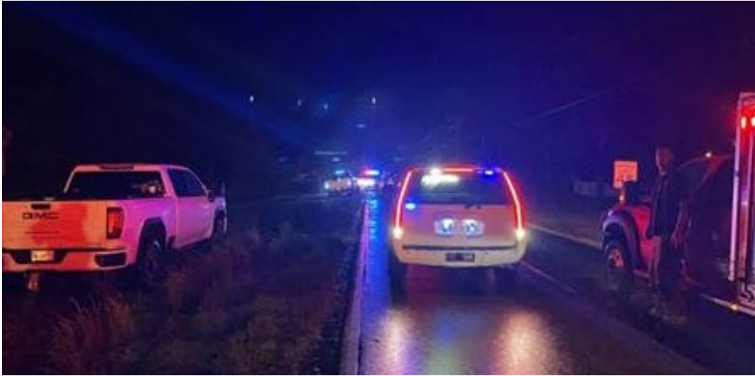
Tree falls on mobile home in West Baton Rouge causing fatality, (WAFB 2024)