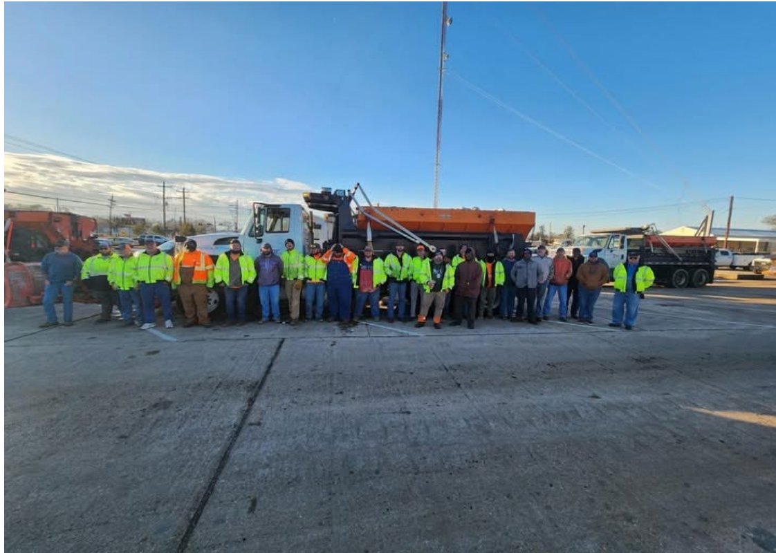
Arkansas Department of Transportation crew that teamed with LADOTD to clear roadways after the winter weather event of 2025