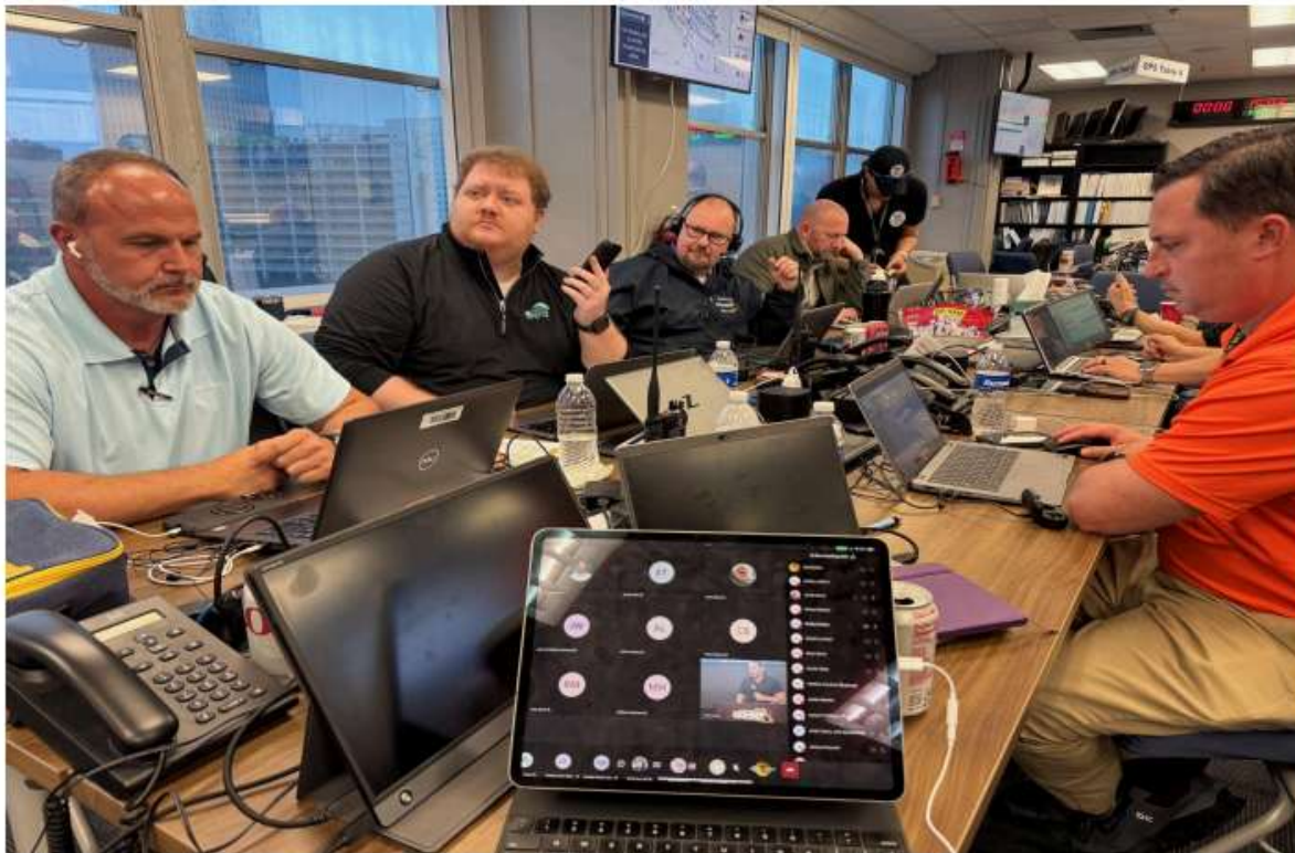
GOHSEP downrange in New Orleans supporting Super Bowl LIX activities