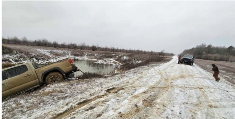
Louisiana Department of Wildlife and Fisheries Enforcement agents assist in the recovery of a vehicle from the ditch.

Operational Period 01/25/2026 08:00:00 - 01/25/2026 20:00:00